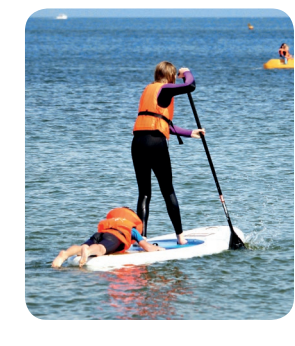
Use safety equipment, such as a life jacket.