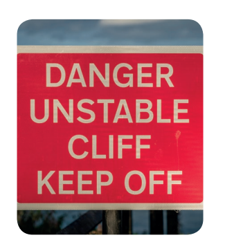
Look for warning signs, follow advice and do not take risks.

The coastline can be a dangerous place. It is important to stay safe and know what to do in an emergency.