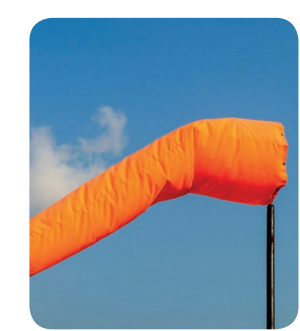
Do not use inflatable toys or airbeds in the sea when a wind sock is blowing.