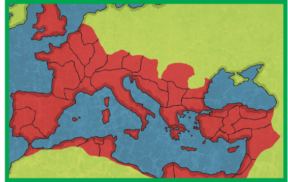
The Roman Empire in AD 117

However, many soldiers fighting in the Roman army did not come from Rome itself. Instead, they came from one of the many countries which were part of the Roman Empire. The Roman Empire included parts of Europe, North Africa and the Middle East.